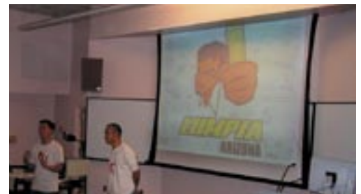
Above: "Lumpia" filmmakers address audience at screening of their film.